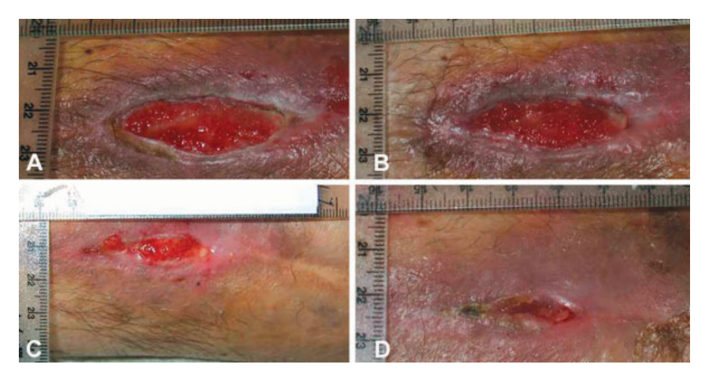
Figure 3. Evolution of a typical skin ulcer treated with PRGF: debrided ulcer before treatment (A), after 1 (B), 4 (C), and 8 (D) weeks, respectively. [Color figure can be viewed in the online issue, which is available at www.interscience.wiley.com.]

0.05). Figure 3 shows a representative case of an ulcer treated with PRGF. At the end of the study, complete healing was observed in only one ulcer from a patient in the PRGF group.